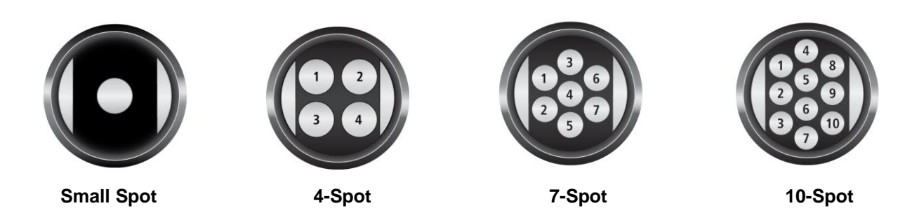
Figure 1. The above diagram shows the different spot orientations of MSD Cytokine Assays. The numbering convention for the different spots is maintained in the software visualization tools, on the plate packaging, and in the data files. A unique bar code label on each plate allows complete traceability back to MSD manufacturing records.

This product insert outlines the Rat Ultra-Sensitive Cytokine Assay protocol that can be used to measure analytes in different matrices such as cell culture media, serum, plasma and other biological fluids. MSD cytokine assays may be provided on SMALL-SPOT or MULTI-SPOT plates. The different plate geometries are shown below.