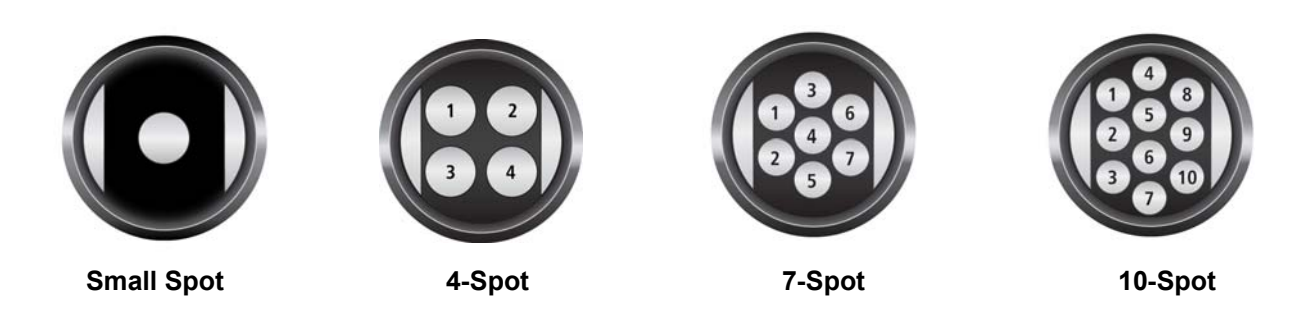
Figure 1. The above diagram shows the different spot orientations of MSD Cytokine Assays. The numbering convention for the different spots is maintained in the software visualization tools, on the plate packaging, and in the data files. A unique bar code label on each plate allows complete traceability back to MSD manufacturing records.

This product insert outlines the Human Ultra-Sensitive Cytokine Assay protocol that can be used to measure analytes in different matrices such as cell culture media, serum, plasma and other biological fluids. MSD cytokine assays may be provided on Small Spot or MULTI-SPOT plates. The different plate geometries are shown below.